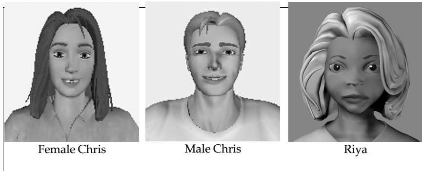
Figure 2 □ Examples of pedagogical agents as learning companions (PALS).

worth noting that the learners in the studies reacted socially to the PALS and perceived the PALS as being more functional and more intelligent than they actually were.